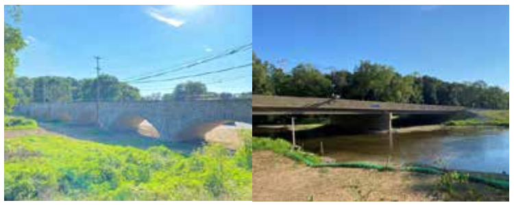
Restoration of the Rt. 52 (Lenape Road) Bridge crossing the Brandywine Creek Floodplain.