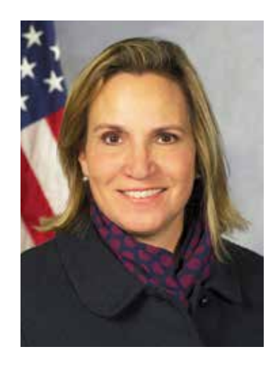
State Representative CHRISTINA SAPPEY

698 Unionville Road Kennett Square, PA 19348